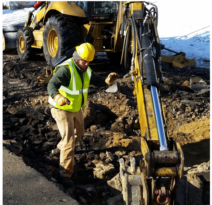
A Manchester Water Works employee repairs a broken water main this past winter.

So hats off to the water utility workers for your dedication and tirelessness. For water is the essence of life, the key to progress and an essential ingredient in coffee, and you kept it flowing while others were at home all warm and cozy on a cold winter's night.