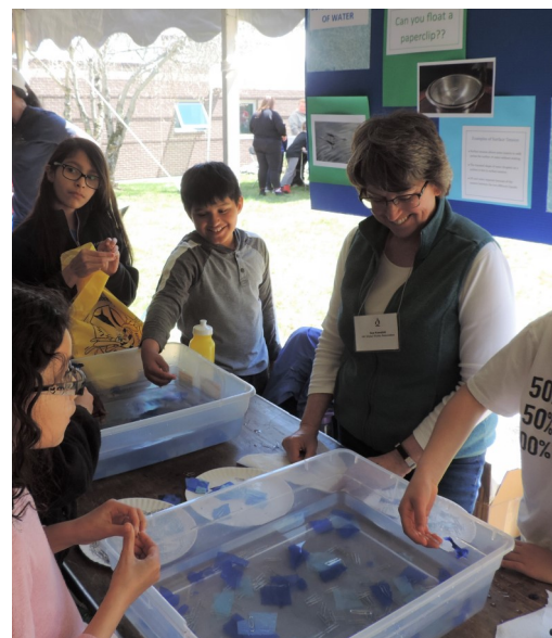
Can You Float a Paperclip? For a number of years, NHWWA staff has provided a surface tension experiment at the festival. The simple activity is always popular with students.

interested in learning more about the NH Drinking Water Festival and Science Fair, or to support the event with a donation, please visit our website at https://www.nhwwa.org/events/nh-drinking-water-festival-and-4th-grade-science-fair .